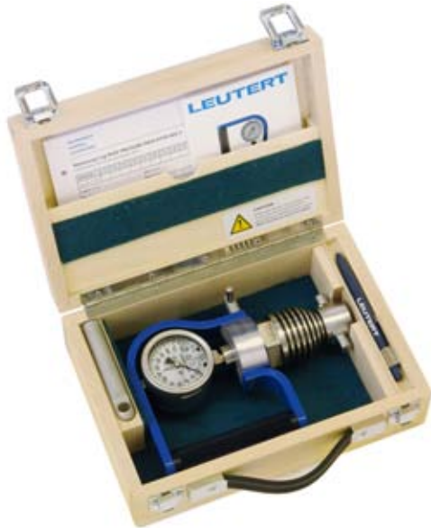
MSI-3 complete in wooden box

The MSI-3 peak pressure engine indicator is designed for displaying the maximum value of gas pressures which are subject to constant and rapid variations. The device is particularly suitable for applicational tasks on Diesel engines.