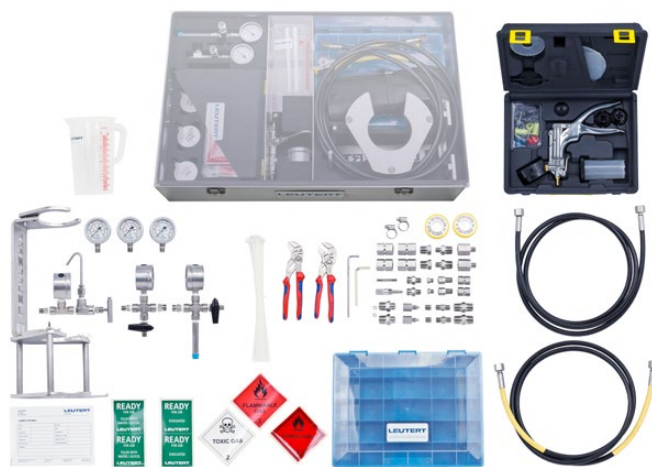
Separator Sampling Kit